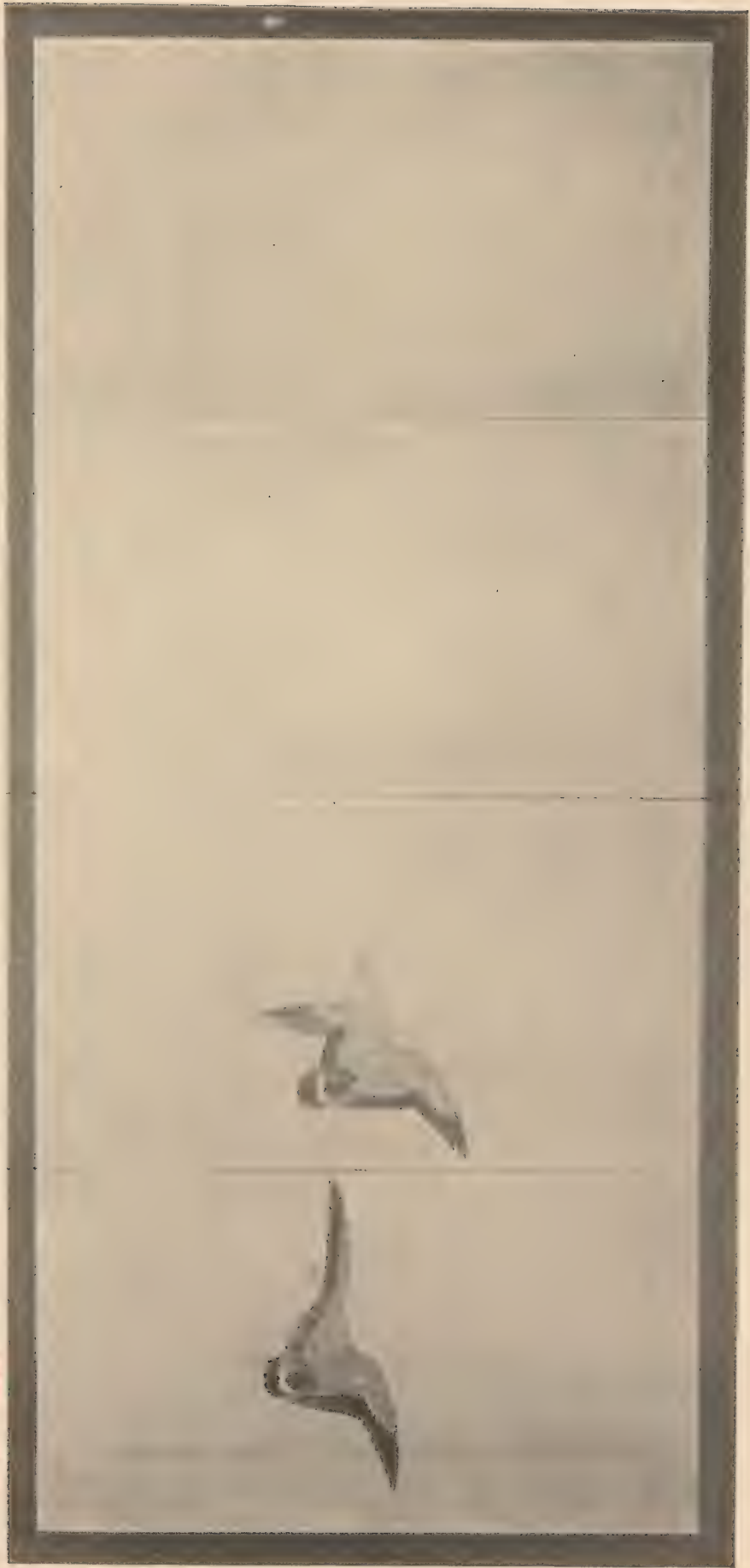
No. 35. By Ohio