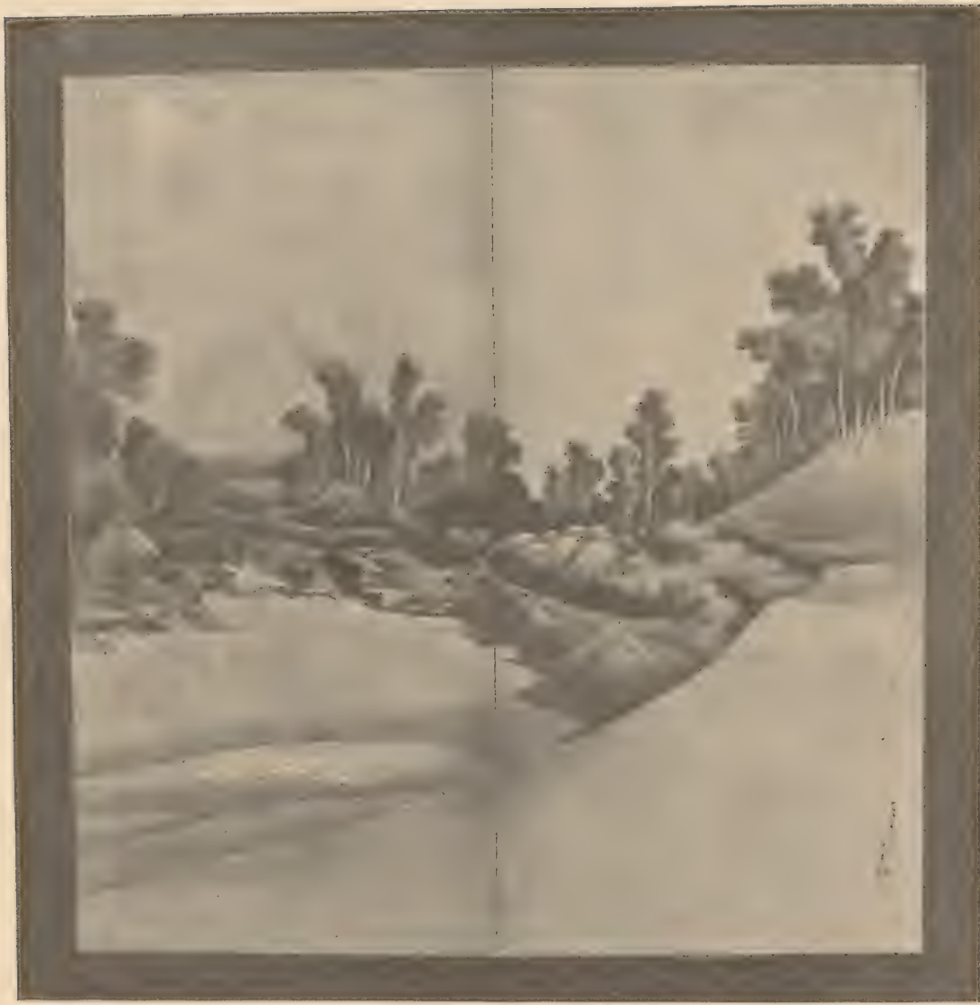
No. 36. By Hokusai