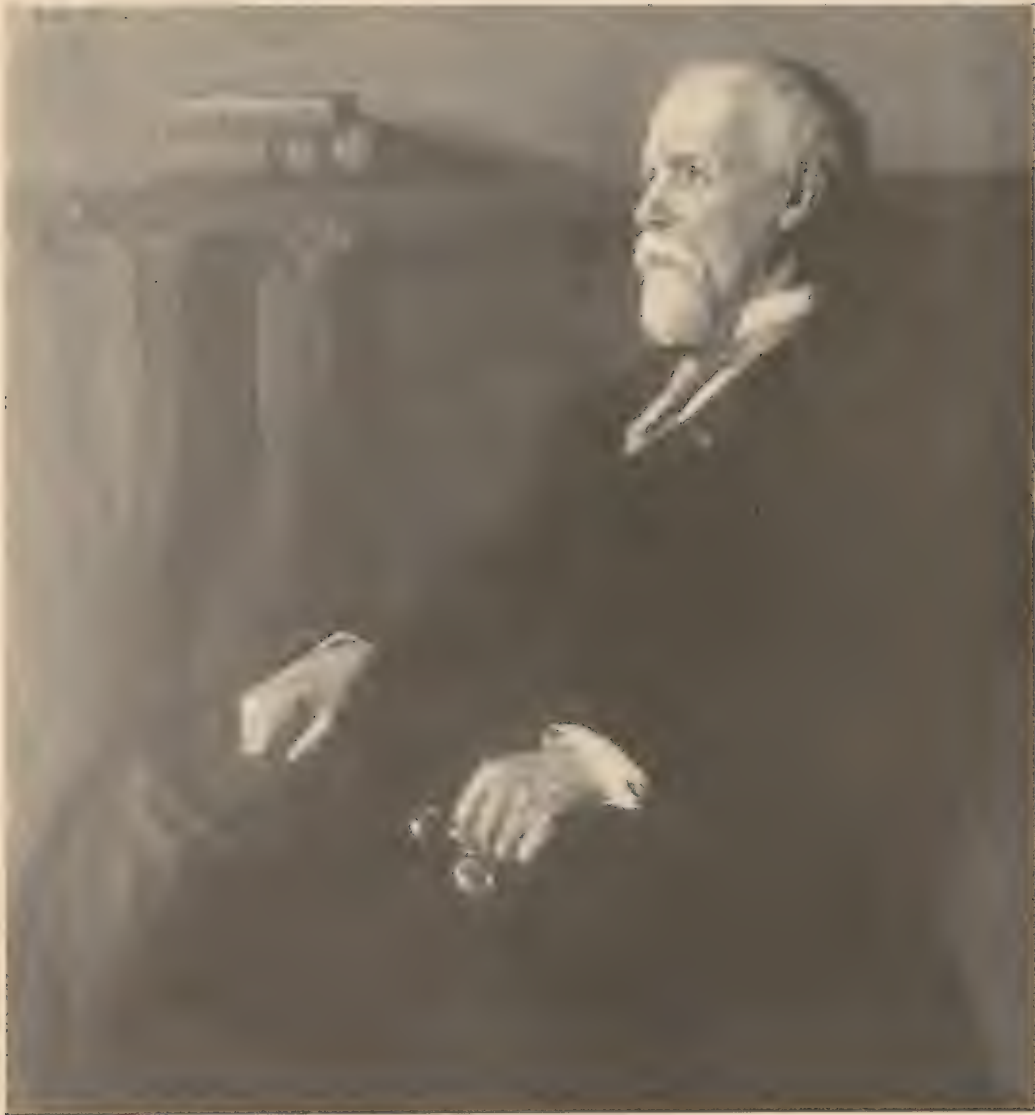
No. 95. PORTRAIT OF GENERAL R. A. ALGER By Gari Melchers