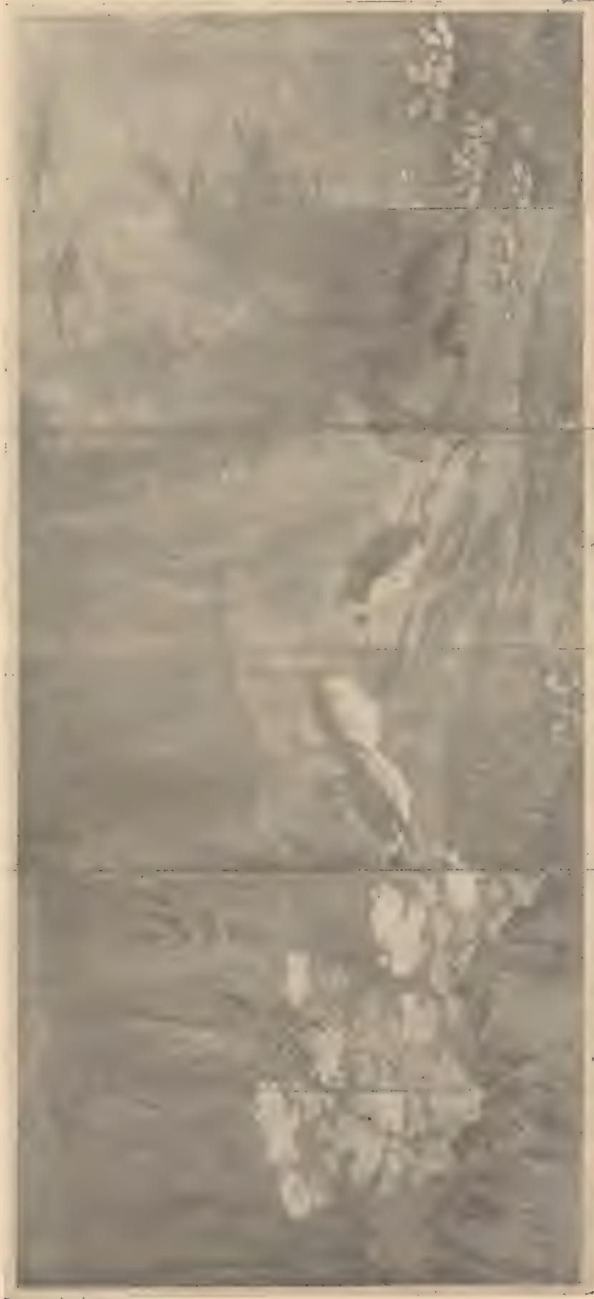
No. 3. By Motonobu