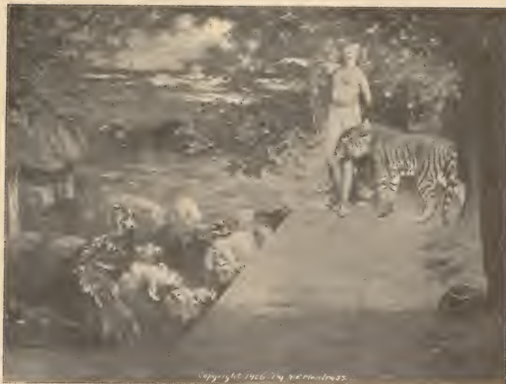
No. 70. THE ENCHANTED STY CIRCE AND THE FRIENDS OF ULYSSES By Horatio Walker