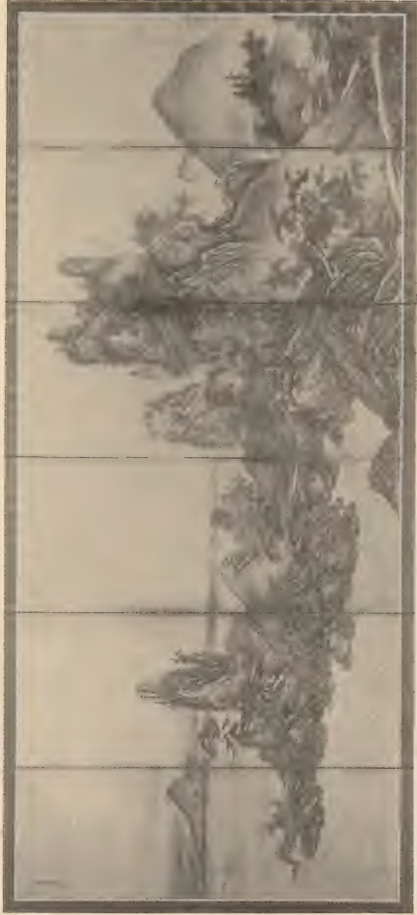
No. 2. By Sesshu