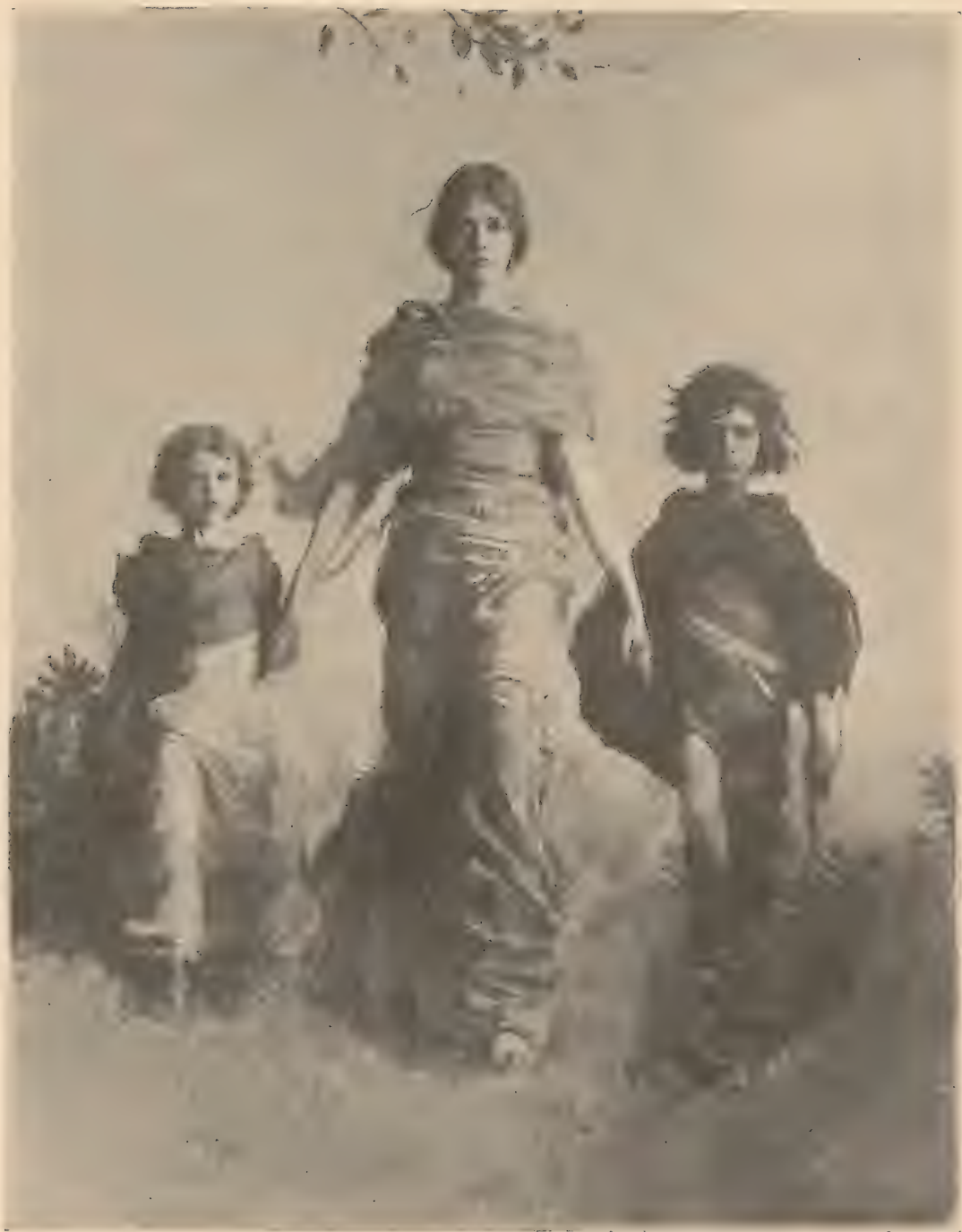
No. 63. THE VIRGIN By Abbott H. Thayer