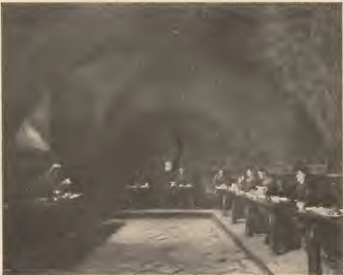
No. 112. THE REFECTORY OF SAN DAMIANO, ASSISI By Julius Rolshoven