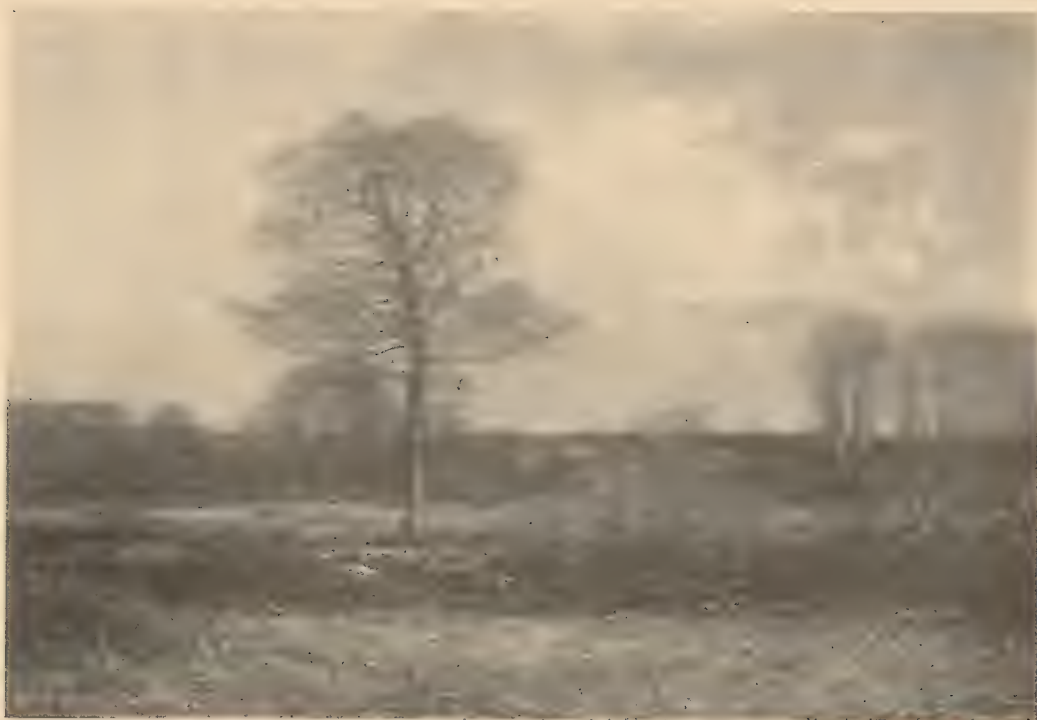
No. 66. AUTUMN MORNING By D. W. Tryon