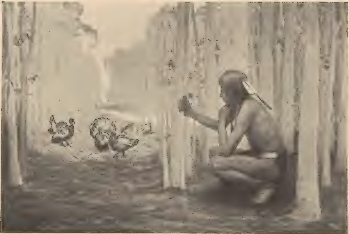
No. 82. INDIAN AND TURKEYS By E. I. Couse