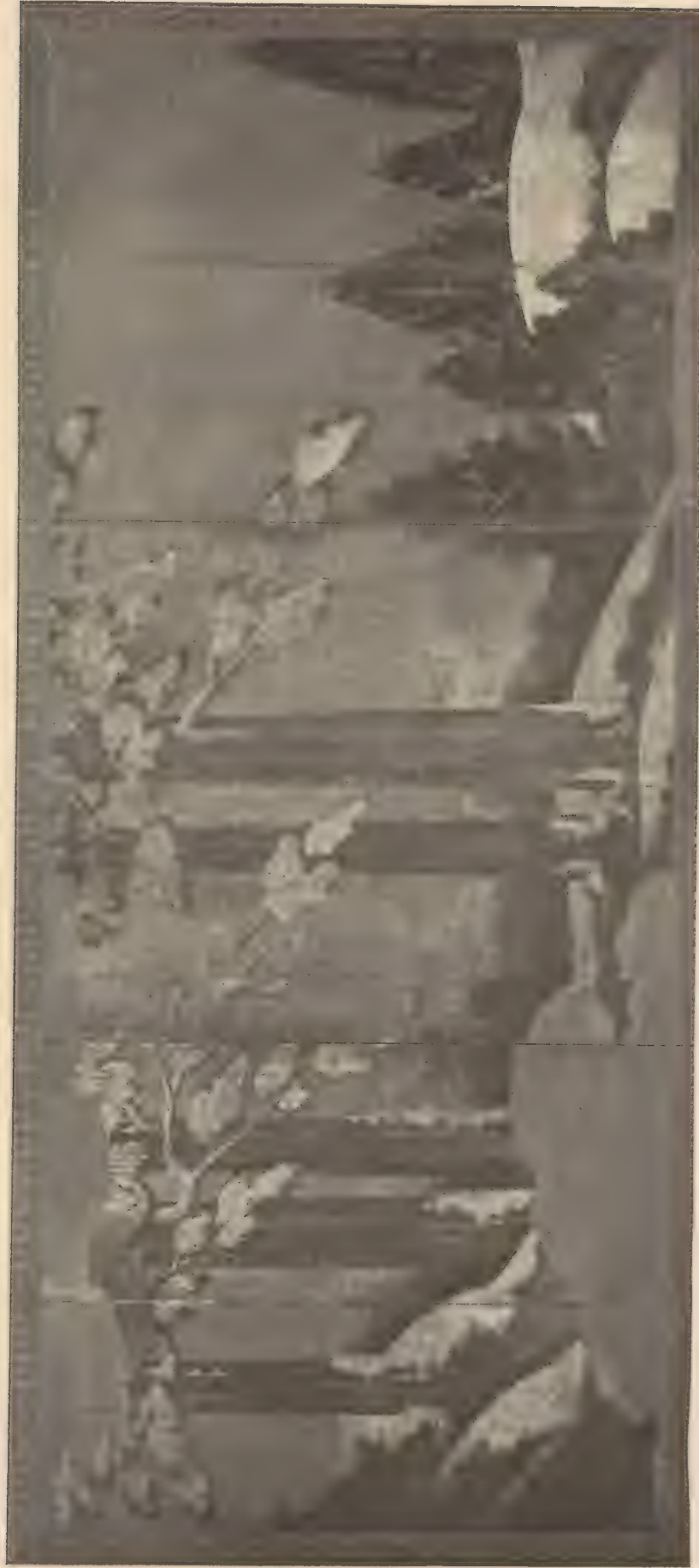
No. 5. By Yeitoku